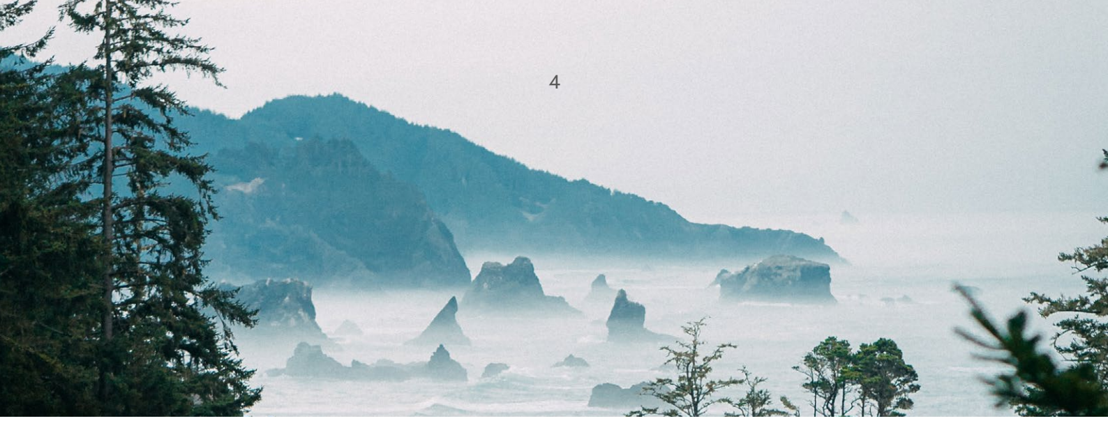
So, how are these ESG factors reflected in investment strategies? There are three main ways: